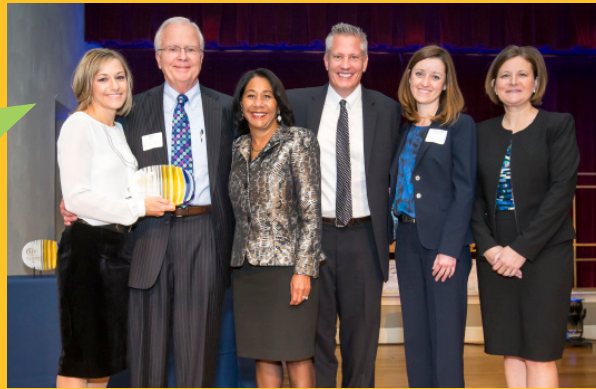
2018 Innovator of the Year bi3