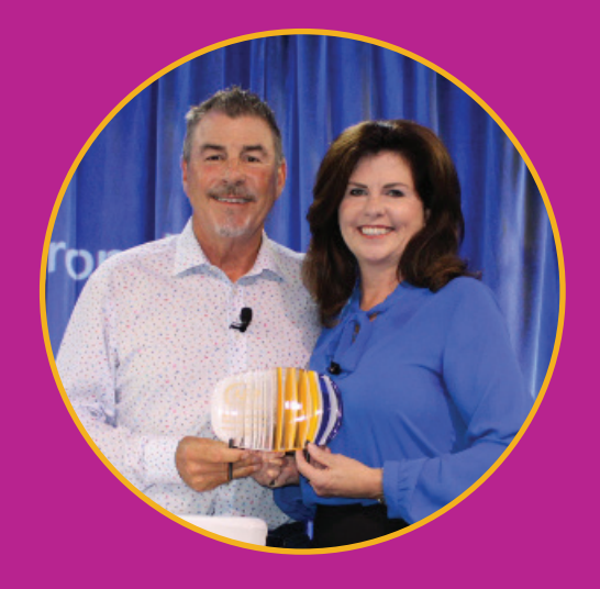
PHILANTHROPIST(S) OF THE YEAR